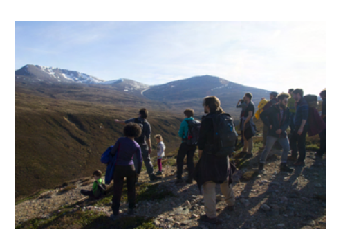
Figure 1: Simon Mudd showing features left by glacial erosion, a corrie is visible in the background.

From the 3<sup>rd</sup> to the 9<sup>th</sup> of April, 14 out of 15 ESRs as well as some PhD and Master students from Grenoble, Rennes and Warsaw met in Edinburgh for 5 days of numerical modelling classes in Python and 2 days of field excursion in the Cairngorms. The focus of the numerical modelling part was first to introduce all of us to modelling using Python (lead by Simon Mudd), and then to use this programming language to model 2D heat diffusion and advection in the mantle (lead by Jeroen van Hunen). The final part brought us back to the Earth's surface. We were introduced to landscape evolution models and how to model surface processes, as well as their coupling to with tectonic/deep processes Mikael Attal and Garcia-Castellanos). On Friday ESRs doing modelling in their projects presented the code(s) they are using as well as the analogue experiments they